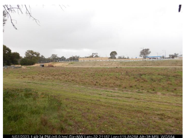
Photo ID: Photo 10 The grassland vegetation west of the subdivision site.