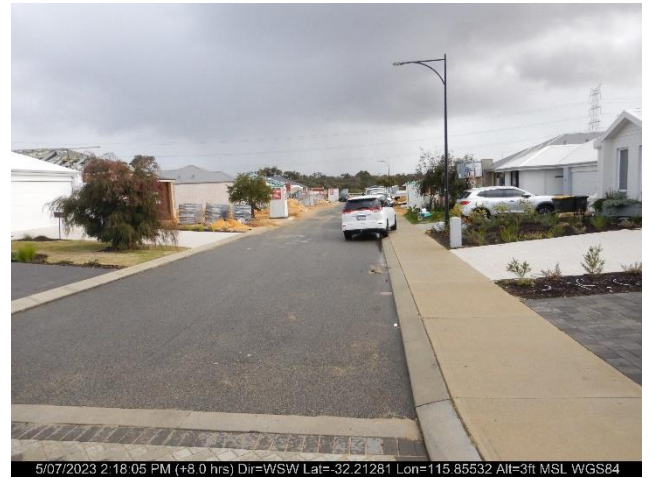
Photo ID: Photo 3 Looking at the established dwellings, footpath and road.