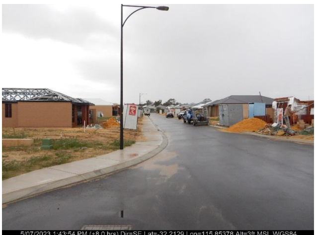
Photo ID: Photo 2 Looking across the subdivision site with lots where construction on new builds has commenced.