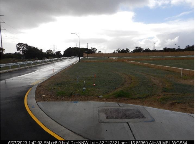
Photo ID: Photo 1 Looking at the lot ready for a dwelling to be constructed.

Exclusion – Low threat vegetation and non-vegetated areas Clause 2.2.3.2 (e) and (f).