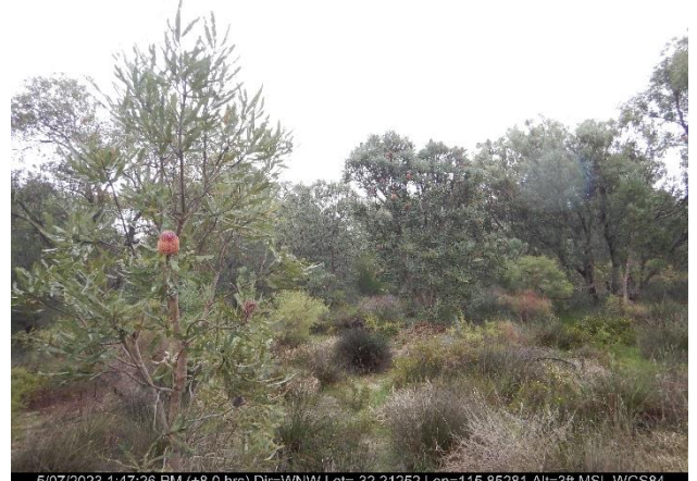
Photo ID: Photo 12 The scrub vegetation west of the grassland neighbouring the subdivision site.