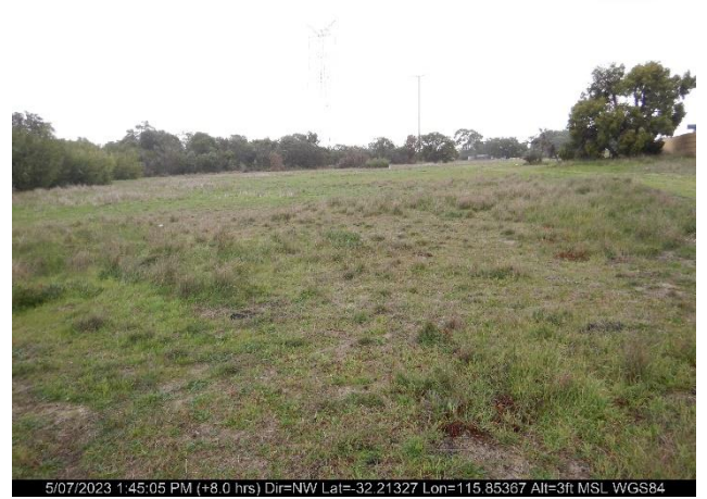
Photo ID: Photo 8 Looking at the grassland and tree on the land to the west of the subdivision.

Class G – Grassland under an open woodland (G – 06)