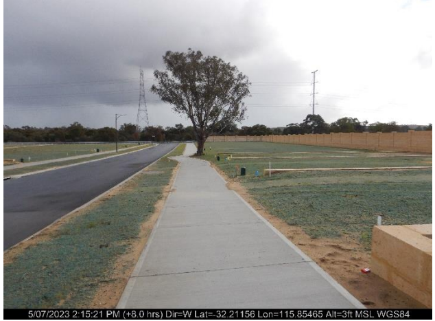
Photo ID: Photo 4 Looking across the land north-east of the lot which is cleared and ready for new dwellings.