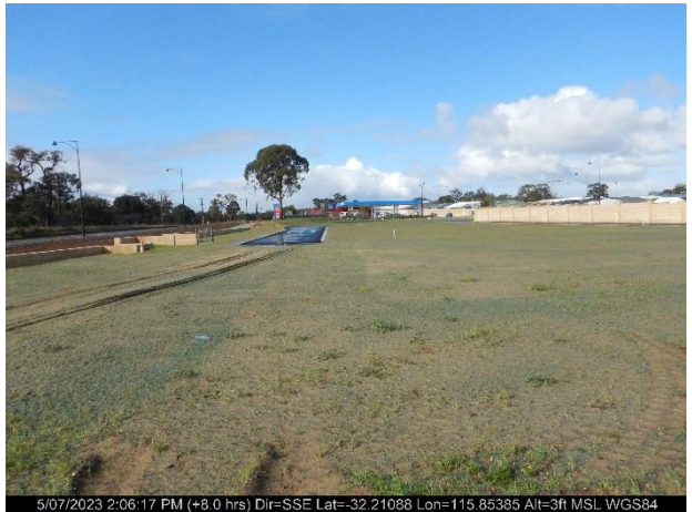
Photo ID: Photo 5 Looking across the land north-east of the lot which is cleared and ready for new dwellings.