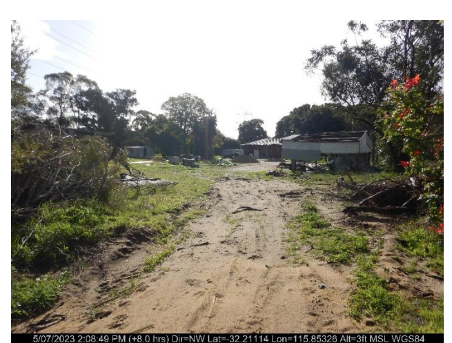
Photo ID: Photo 11 The grassland vegetation within the derelict neighbouring house yard.