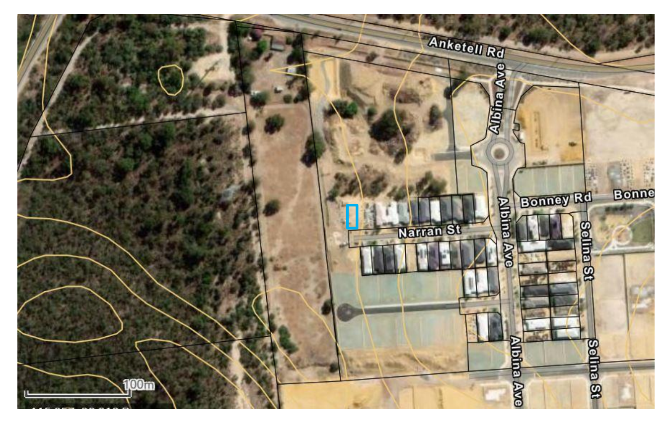
Figure 2: Two-metre Contour Map.

The pale orange lines on the contour map are two-metre contour lines. The slope is assessed as being south-west to the north-east, as confirmed by the contour map. The slope is associated with the vegetation and therefore there would be minimal impact on the bushfire rate of spread because of the slight slope.